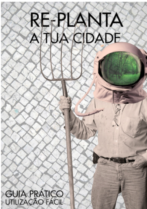
Figure 2. Example of student's work assessing a Good Practice Guide for Public Users towards the Food System.