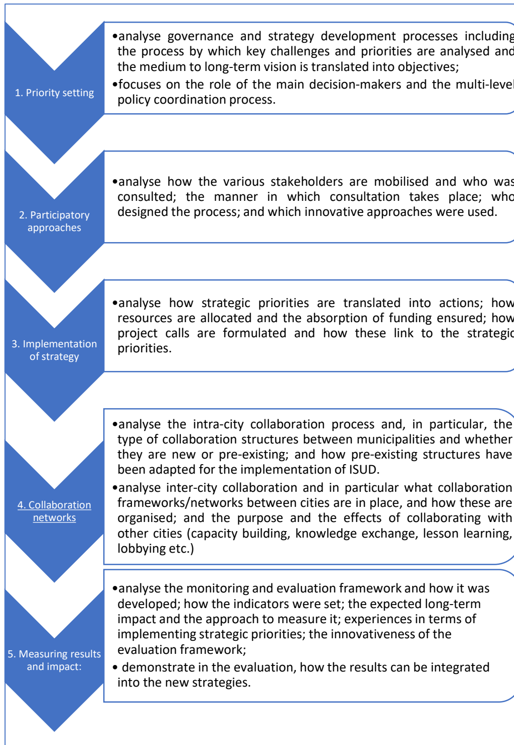
Figure 1. Analytic framework to assess the implementation of the Integrated Strategies for Sustainable Urban Development (ISUD). Own elaboration.

sized city in a vast depopulated territory, suffering from systematic depopulation and aging trends in its historic centre.